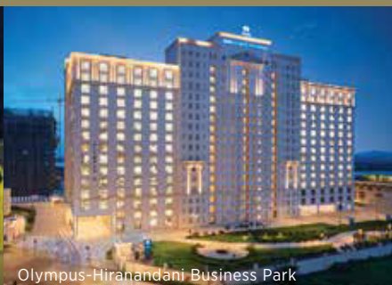
Olympus-Hiranandani Business Park