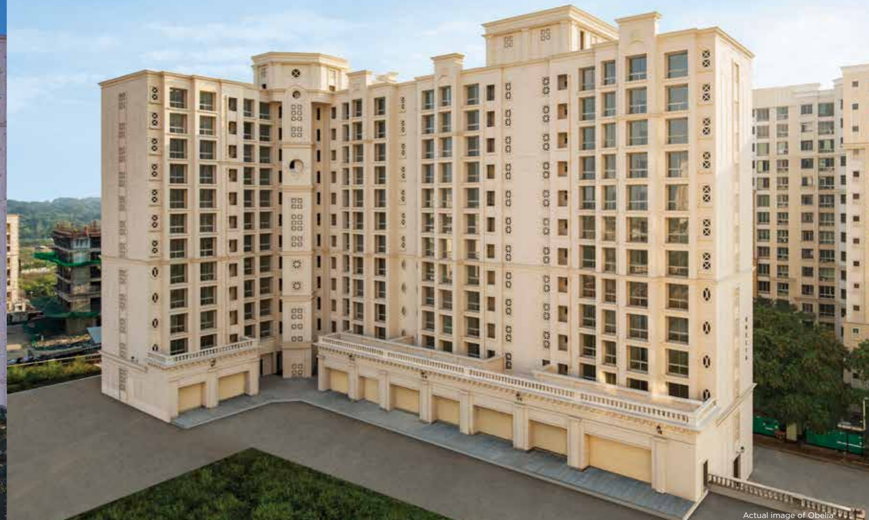
Actual image of Obelia

Hiranandani aims to delight the residents with something new each time – this time it is high street living. Planned meticulously to give you spacious homes and unparalleled conveniences, Obelia at The Walk is wisely nestled in an ambience brimming with retail vibrancy.