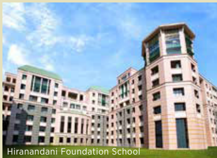
Hiranandani Foundation School