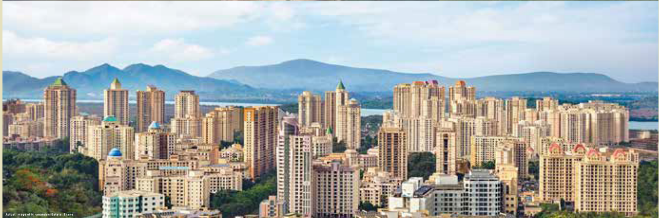
Actual image of Hiranandani Estate, Thane

TOWNSHIP FEATURES - Hiranandani Foundation School • Hiranandani Hospital • Clubhouse • Gymnasium • Squash Courts Badminton Courts • Landscaped Gardens • Pedestrian-friendly, Tree-lined avenues • The Walk - High Street Retail