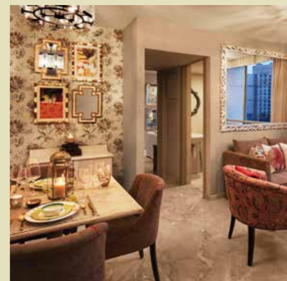
The above image shown is of show apartment of Fortuna for reference purpose only. The furniture & fixtures shown in the above flat are not part of the apartment amenities.